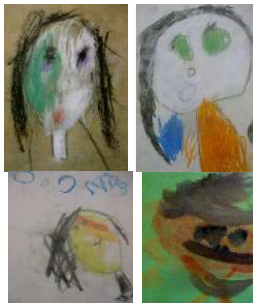
Celebrating Ourselves Through Art