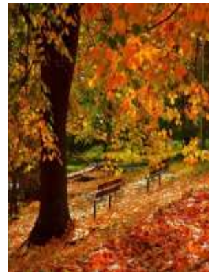
From 'Poetry Basket'

Leaves are falling, leaves are falling, One fell on my nose. Leaves are falling, leaves are falling. One fell on my toes. Leaves are falling, leaves are falling. One fell on my head. Leaves are falling, leaves are falling. Yellow, orange, red.