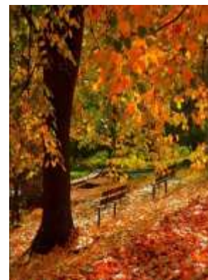
From 'Poetry Basket

Leaves are falling, leaves are falling, One fell on my nose. Leaves are falling, leaves are falling. One fell on my toes. Leaves are falling, leaves are falling. One fell on my head. Leaves are falling, leaves are falling. Yellow, orange, red.