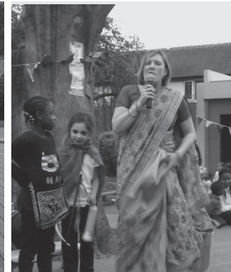
A few performances from our community evening.